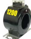
CT361 \phi 38*3.02kgs